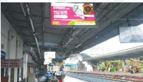
BRAND VISIBILITY: New hoardings about Indiana Hospital were installed at Railway Station in Payyannur, a Taluk headquarters in Kannur district, Kerala. One such hoarding is seen here.